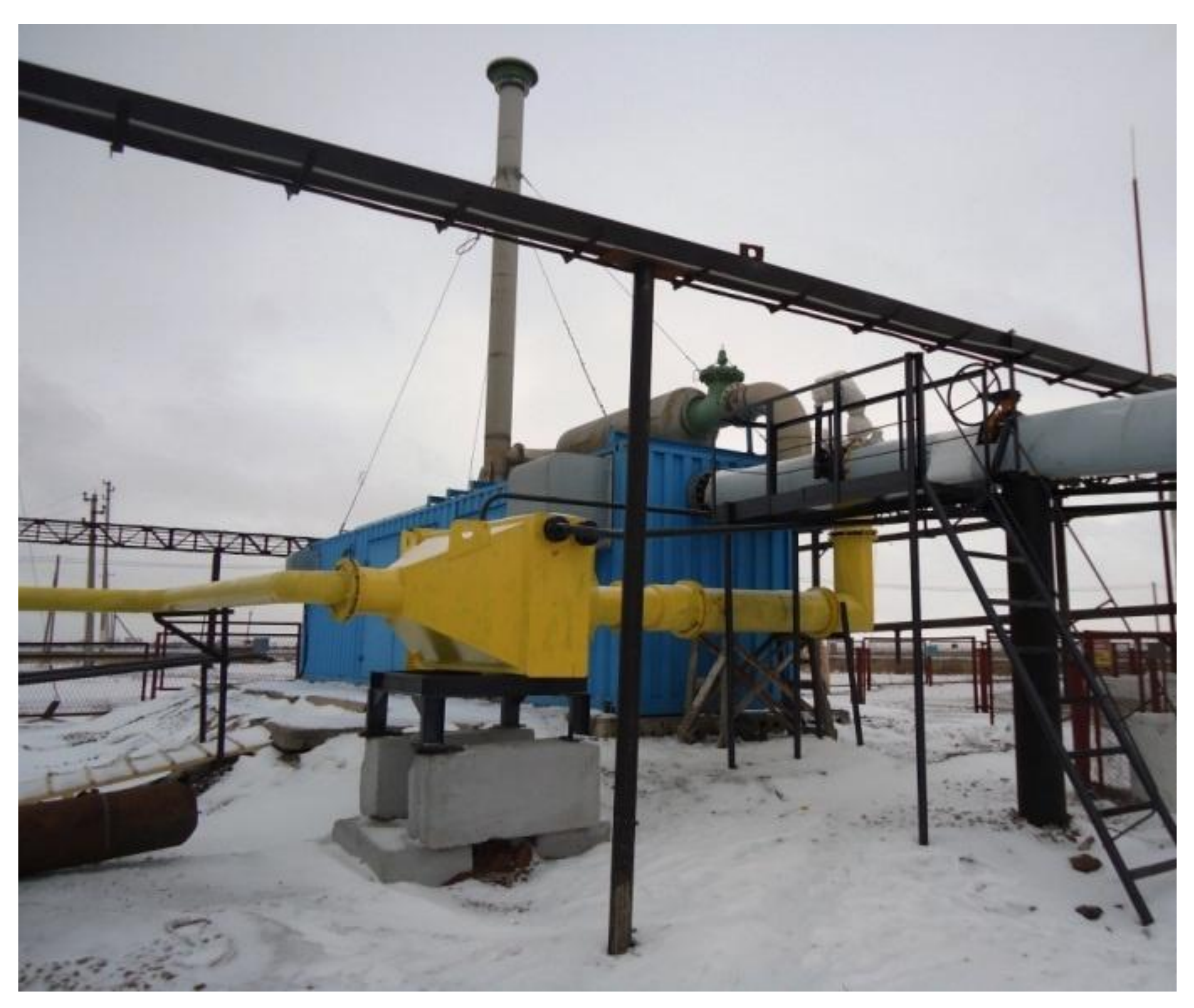
Methane Extraction Plant and Gas Cooler