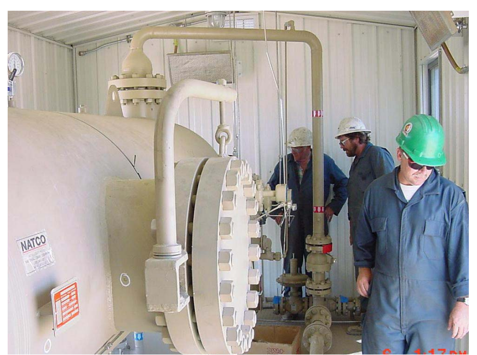
Portable Three Phase Separator