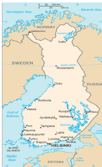
Figure 11-1. Location of Finland's Coal Reserves