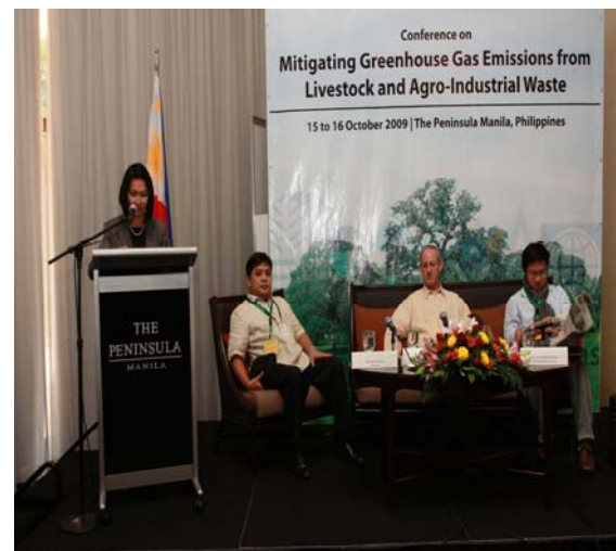
Panel Discussions: Philippine Opportunities for Reducing Methane Emissions in the Pig Sector and Philippine Opportunities for Reducing Methane Emissions in the Agro-Industrial Sector