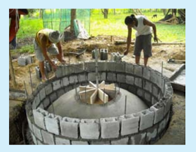
Stacked fixed dome digester construction at Nueva Vizcaya, Philippines

The trainees are selected from a pool of private sector, public sector and academic applicants based on experience and other criteria. The training program is completed in a series of classroom and hands-on workshops that include the development of at least one commercial AD technology. The training could be used as part of a certification program for AD technicians. Training and certification ensures that an adequate support sector exists in countries implementing broad AD programs.