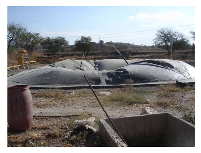
Illustration 3. Anaerobic digester. Farm Santa Mónica. La Piedad Michoacán. Mexico