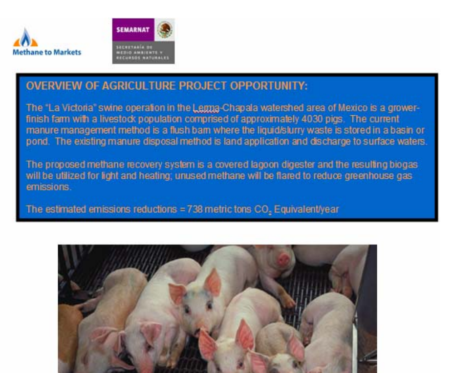
Illustration 4. Example of a Project under M2M Initiative.