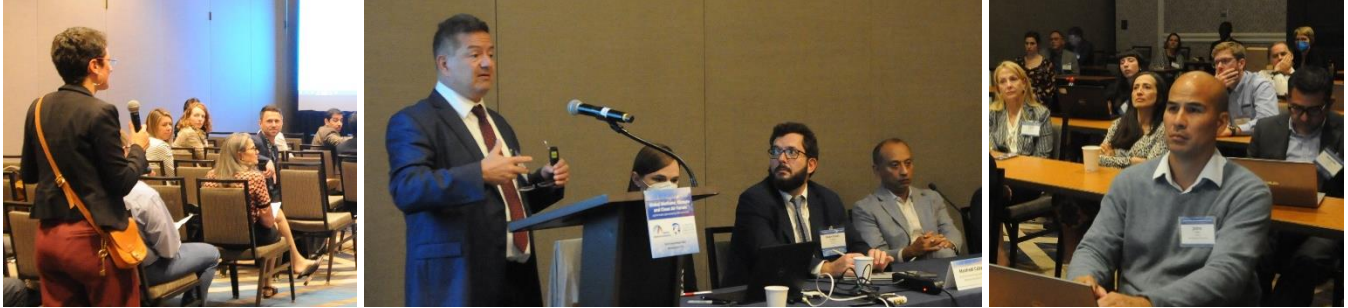
Participants engage in discussions about specific challenges and opportunities during joint technical sessions.

Addressed challenges and opportunities for project financing. Plenary and technical sessions engaged participants in discussions about financial challenges associated with abatement projects. For example, participants were reminded that financing directed to methane abatement constitutes less than 2% of total climate finance despite the ability to demonstrate tangible results for methane capture and emission reduction projects. Presentations stressed the importance of avoiding methane emissions altogether by incorporating best possible technologies into project designs. Speakers also encouraged transparency among governments, industry, financial partners, and other stakeholders in order to build trust.