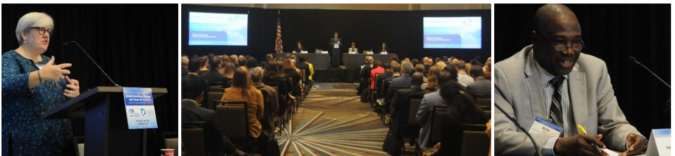
Speakers and participants during keynote addresses at high-level plenary sessions.

Concluded with a high-level joint statement to summarize the importance of the Forum as a call to action. The GMI and CCAC joint statement urged all countries to consider several key measures to take ambitious steps to reduce methane emissions and other SLCPs. GMI and CCAC also committed to continue to work together in substantive ways to drive ongoing progress.