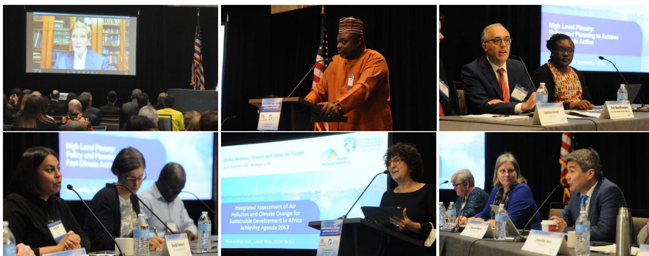
Speakers deliver presentations and respond to audience questions during daily plenary sessions.