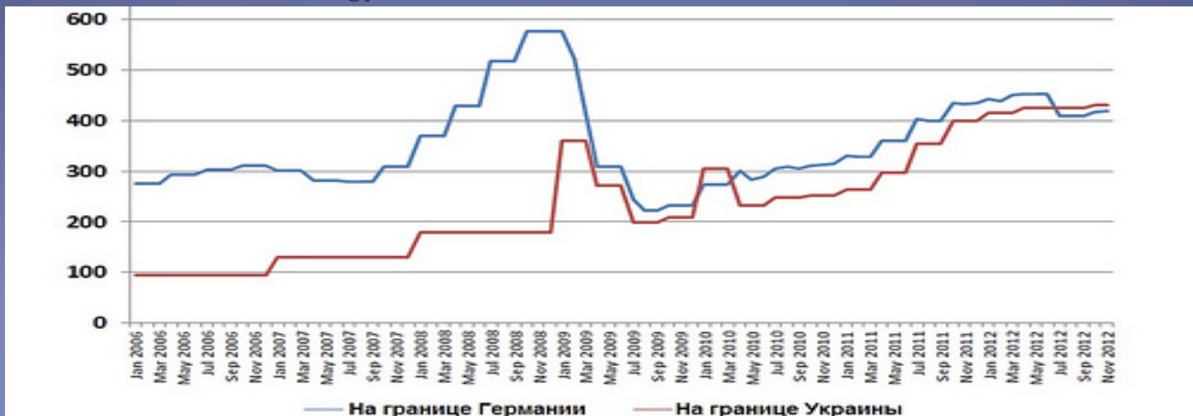
Dynamics of natural gas price