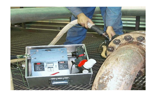
Oil and Gas Systems