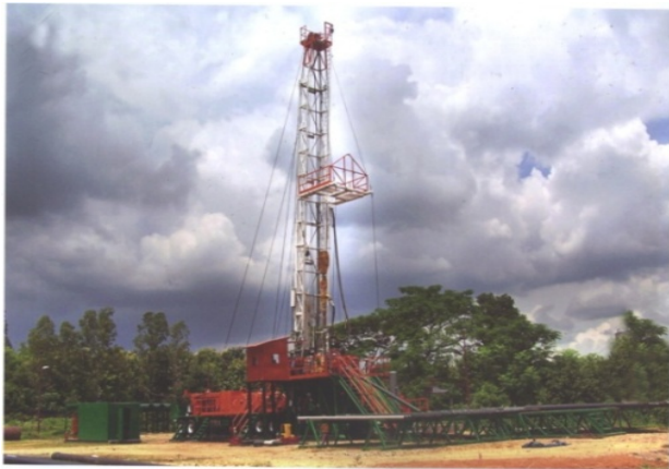
Well Drilling Rig Unit