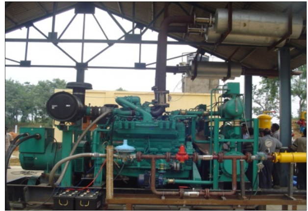
Gas-based Power Generator