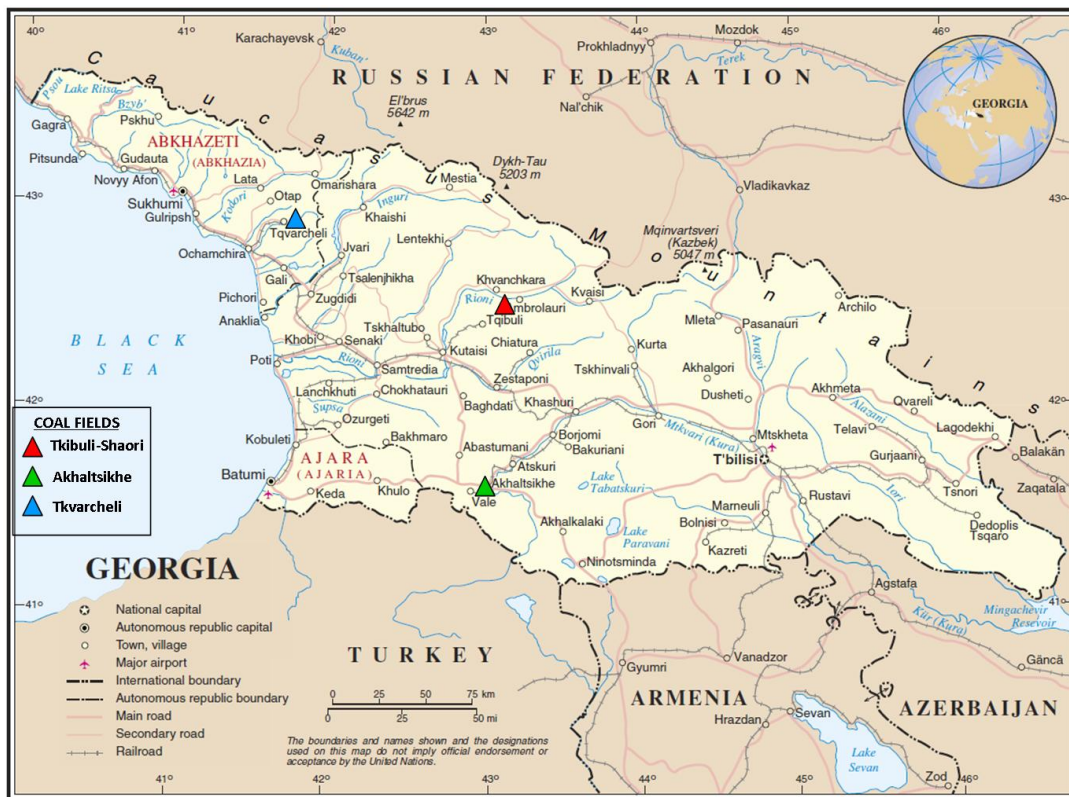
Figure 13-1. Georgia's Main Coal Fields

Coal deposits were discovered in Georgia in the first half of the 19th century, although until the 1930s geological exploration of these deposits was sporadic. Rapid development of the coal deposits in Georgia began after World War II, with produced coal being supplied to the Rustavi iron and steel works. Seven coal deposits have been discovered in Georgia, but only three of them are of commercial importance: the Tkibuli-Shaori and Tkvarcheli bituminous coal deposits and the Akhaltsikhe brown coal deposit (Figure 13-1). Most of the republic's coal reserves are concentrated in these deposits and the Tkibuli-Shaori deposit accounts for more than 75 percent of Georgia's coal reserves, followed by Akhaltsikhe and then Tkvarcheli (UNFCCC, 2009).