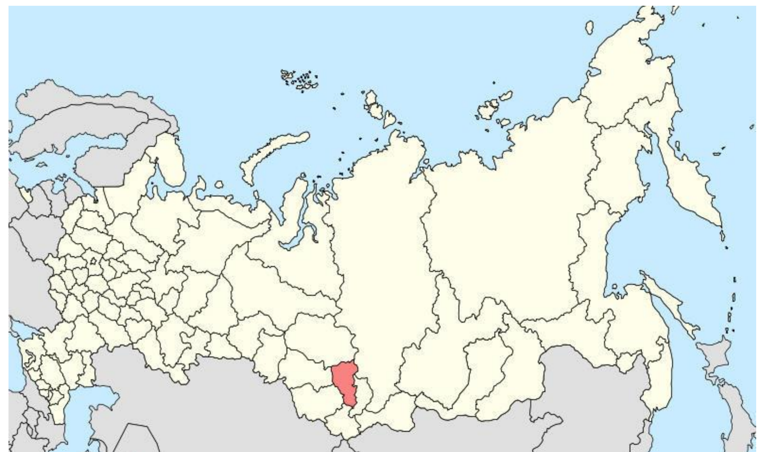
Map of Russia showing Kemerovo Oblast