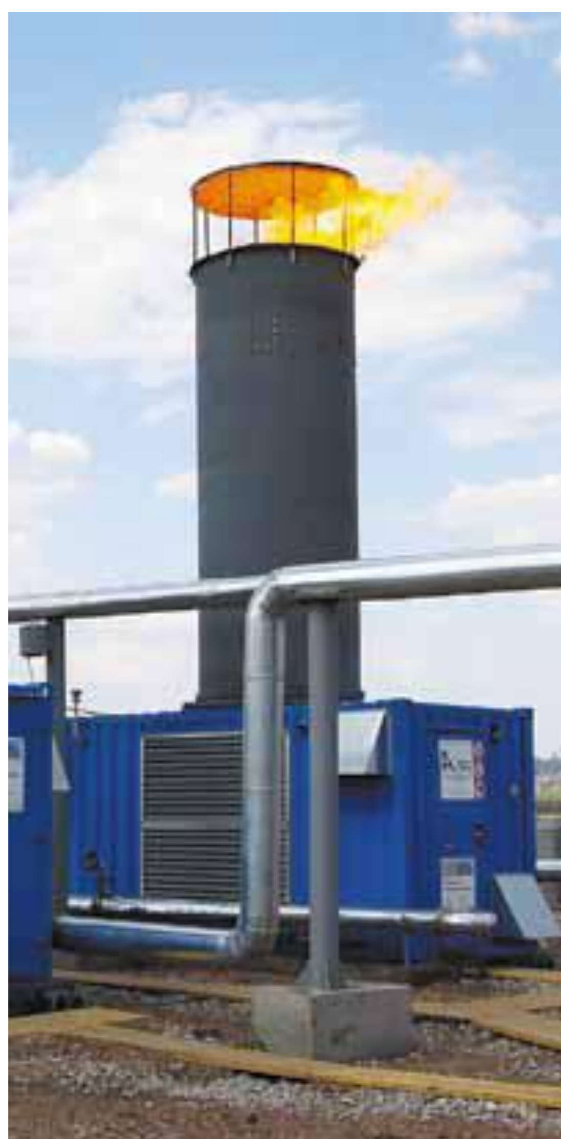
Coal Mine Methane Utilization in Gas Generating Plant with flare for excess gas