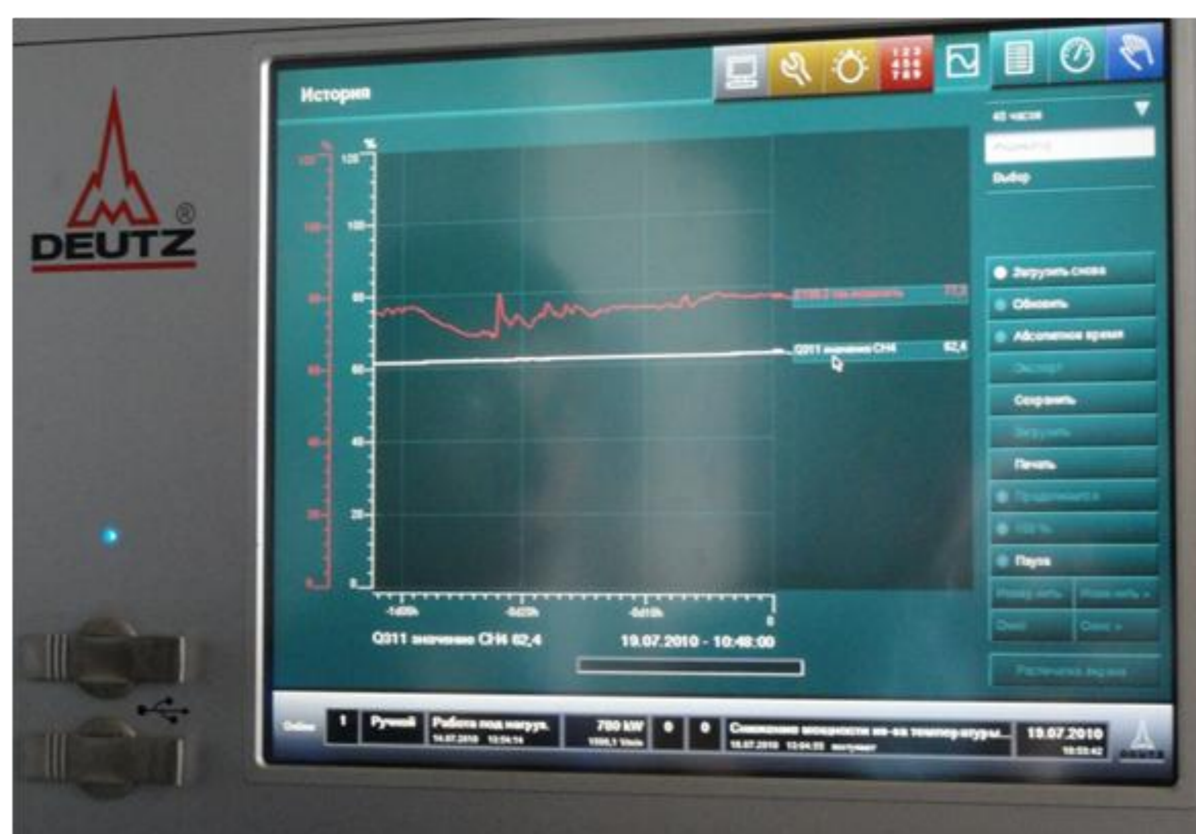
Methane Monitoring Equipment Inside the 1 MW Power Station