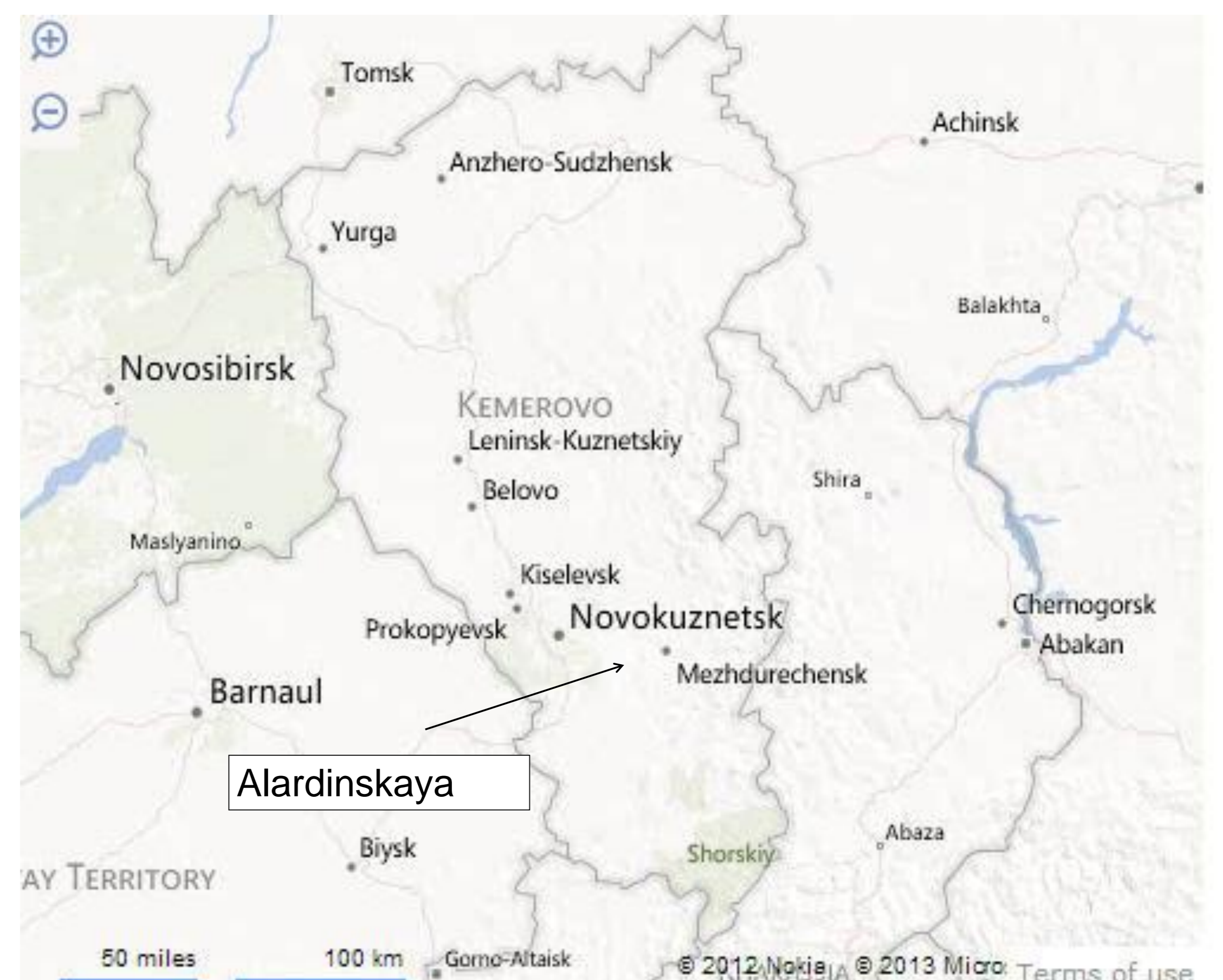
Map of Kemerovo Oblast showing Mine