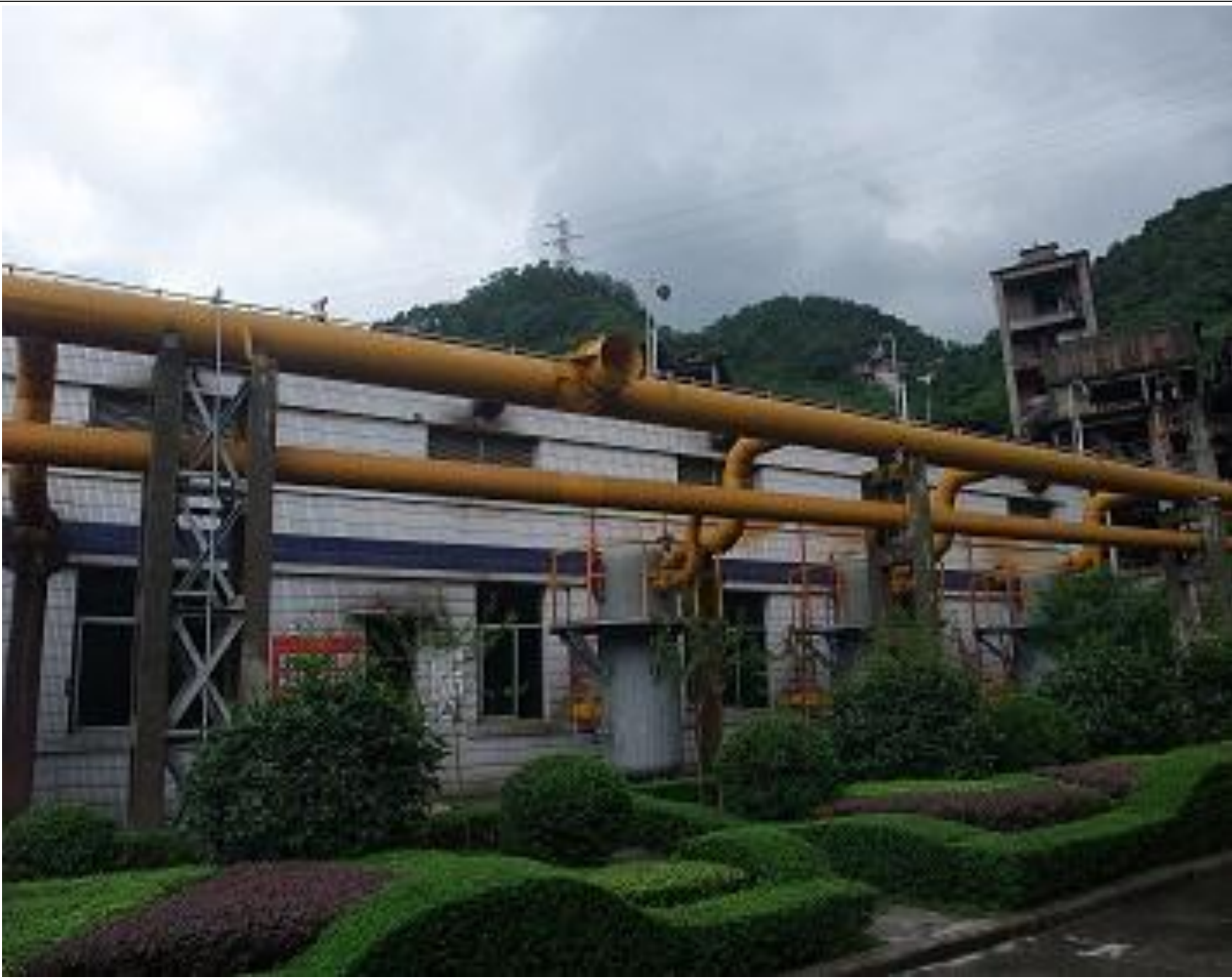
Pipelines Transporting CMM from Storage Tank to End Users