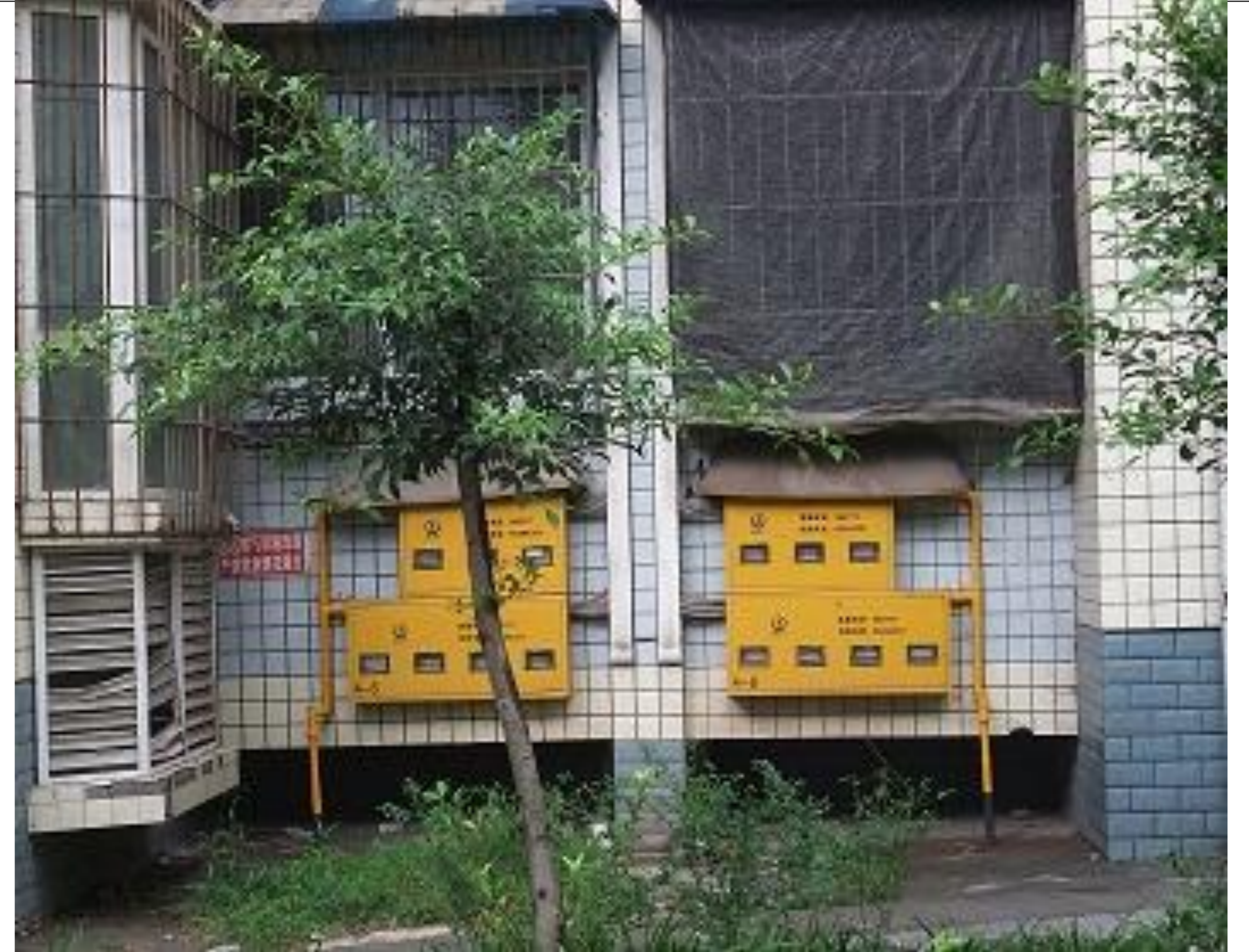
CMM Meter for Household Users